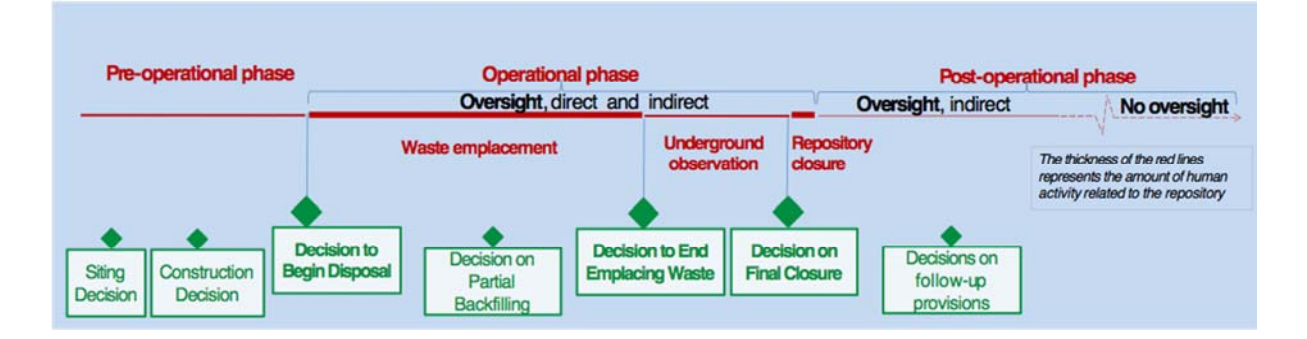
Fig. 2. Repository life phases and periods of oversight. The actual duration of each life phase will vary with each national disposal project.

These foreseen periods of oversight correspond to phases in the lifetime of the repository as illustrated below in Figure 2.