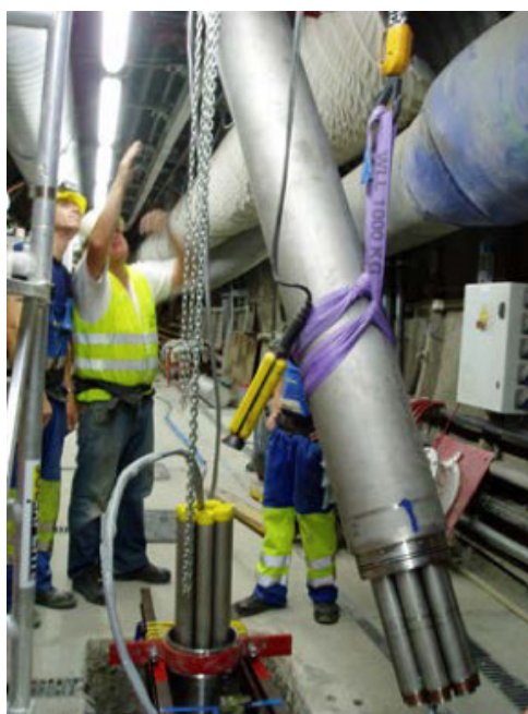
Experiments being conducted at the Meuse/Haute-Marne URL in France

S Generic URLs offer a geological environment for experimentation but not necessarily one that closely mimics the final repository. They help create generic expertise for working and acquiring technical data in an underground environment. Early generic URLs were sometimes created in pre-existing mines: the Stripa mine in granitic rock (1976-1992), in Sweden; the Tono mine in sedimentary rock (1986-2004), in Japan. In Switzerland and France, generic URLs have been built near tunnels: at Grimsel in granitic rock (1984), at Mont Terri in hard clay (1995), at Tournemire in hard clay (1992). Others have been purpose-built at depth: Whiteshell in granitic rock (1982-2010), in Canada; HADES in a soft clay formation (1980), in Belgium, and, more recently, Mizunami in granitic rock (2003) and Horonobe in sedimentary rock (2005), in Japan, and KURT in granitic rock (2006), in Korea.