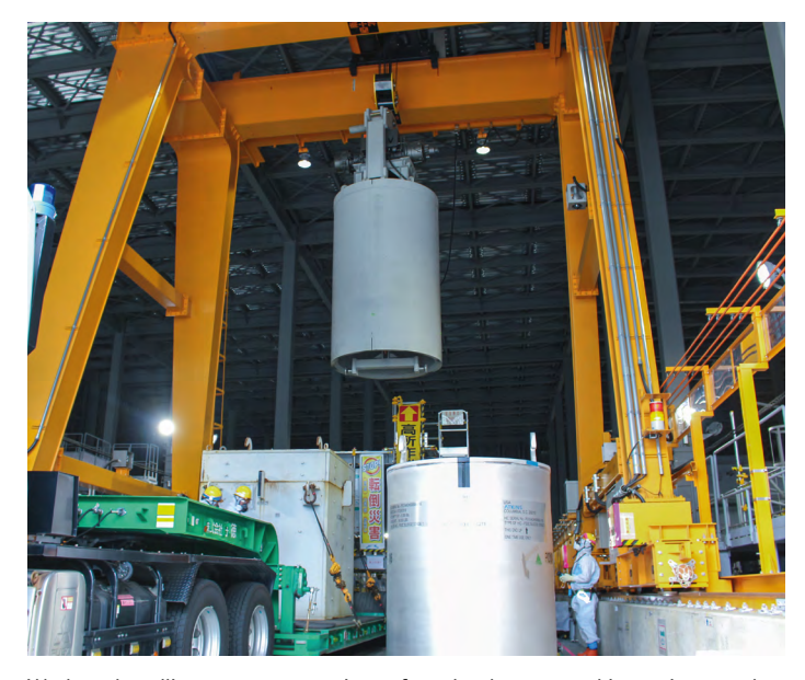
Workers handling storage containers for adsorbents used in equipment that purifies water containing radioactive substances generated on the premises of the Fukushima Daiichi Nuclear Power Plant. The used adsorbents are stored and sealed in a robust container.

The accident at Fukushima Daiichi transformed perceptions regarding the role of citizens in government decision-making about nuclear energy, especially at the local level. In Japan and in several other countries, the accident significantly undermined public trust in governmental oversight of, and communication about, nuclear energy. In some NEA member countries, it underscored the need to take into account the knowledge, values, interests and preferences of concerned communities in nuclear decision making, including for accident preparedness and recovery in affected areas. The years after Fukushima Daiichi have seen continued worldwide debate about the so-called "social licence" for nuclear energy-related decisions: "is this to be granted by duly elected or appointed government officials, or by