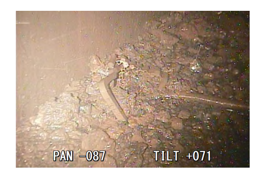
Fuel debris inside the primary containment vessel in the Unit 2 reactor building at the Fukushima Daiichi Nuclear Power Plant (fuel debris is a substance that has cooled and re-solidified while being mixed with various materials after the fuel in the reactor melted as a result of the accident). The image was captured by a remote-controlled camera attached to the tip of a survey device.

Additionally, the NEA can assist Japan in its development of the basis for fuel debris retrieval by co-ordinating the gathering of information from member countries on important topics such as: