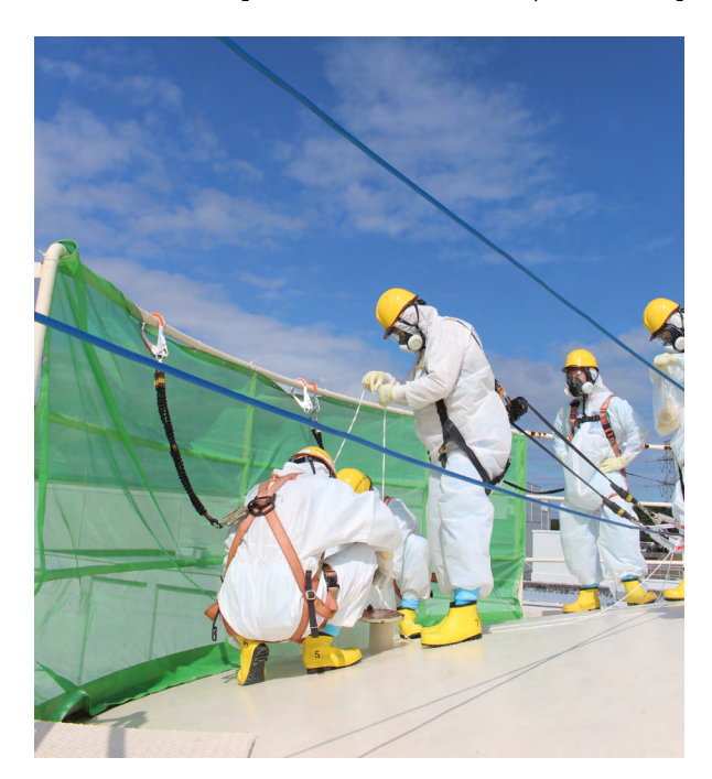
Workers maintaining a tank storing treated water on the premises of the Fukushima Daiichi Nuclear Power Plant.

While post-accident analyses have verified that the radiation from the accident has not led to any direct impact on human health, the evacuation of more than 150 000 people living in surrounding areas is reported to have resulted in early deaths associated with the evacuation of citizens from the area, lack of access to health care or medicines, stressrelated problems, and other causes. The series of events – the earthquake, the resulting tsunami and nuclear accident, and later the evacuation and some other post-accident recovery measures – impacted the well-being of individuals and the community.