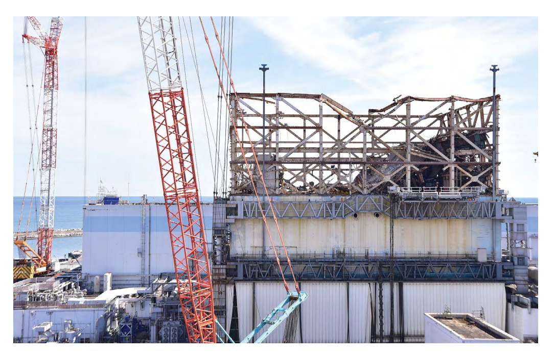
State of the Unit 1 reactor building at the Fukushima Daiichi Nuclear Power Plant (photo taken in March 2021). After a large cover is installed over the top of the building and rubble is removed, it is planned to start fuel removal in the spent fuel pool in the fiscal years 2027 to 2028.

Shortly after the 2011 accident, significant joint studies were initiated by the Nuclear Energy Agency (NEA), member countries and, importantly, the government of Japan. These included a benchmark study of the accident at the Fukushima Daiichi Nuclear Power Plant started in 2012, and post-Fukushima safety research started in 2013. Governments, regulators, technical organisations, operators and other stakeholders of the NEA and member countries, including Japan, moreover undertook organised safety-enhancing activities in response to the accident at Fukushima Daiichi. In general, these activities have contributed to establishing a common understanding of the accident and led to improved tools and a better quantification and understanding of plant safety margins.