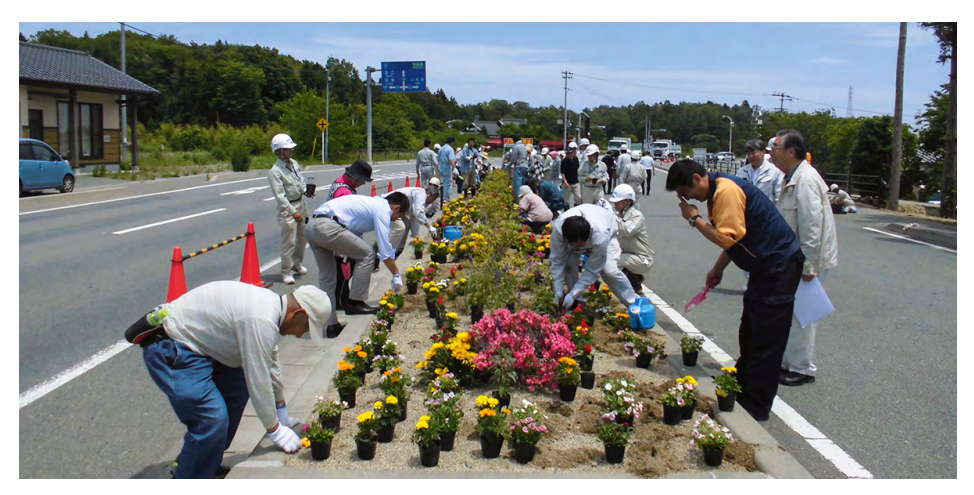
Flower beds along the road in Tomioka Town (photo taken in June 2016).

The NEA is in a unique position to assist with its close connection to the wider expertise in the OECD. The NEA can access specific country-based experience in rebuilding deprived areas, whether or not these are characterised by widespread radioactive contamination and evacuation. Such synergistic work could potentially assist Japan, and also benefit other countries confronted by the need to rebuild local economies in a sustained and sustainable way. The NEA has already published several reports in this area (NEA, 2014n; 2019g; forthcoming h). Such work has to take into account ethical considerations (see section 6.7) such as respecting the rights and autonomy of individuals.