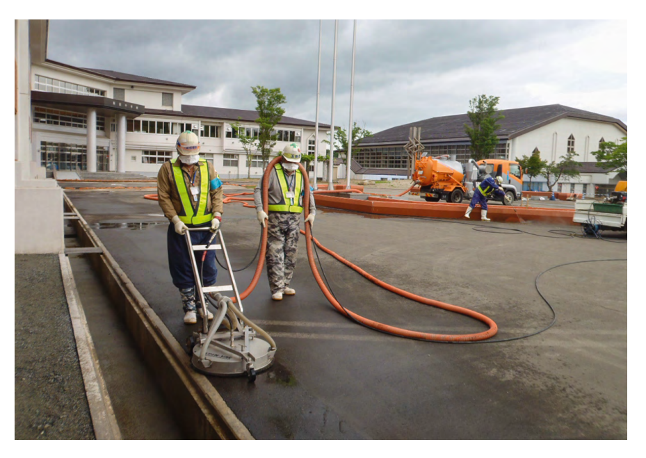
High-pressure cleaning to decontaminate the pavement surface outside the litate Junior High School building in litate Village (photo taken in July 2016).

In late 2011 ICRP began a Dialogue Initiative between experts, authorities, professionals, NGOs, local communities and representatives of Belarusian, Norwegian and French organisations with direct experience in managing long-term consequences of the Chernobyl accident, to find ways to respond to the challenges of the long-term consequences of the Fukushima Daiichi accident. The NEA supported and participated in these dialogues and applied many important lessons into its work on stakeholder engagement.