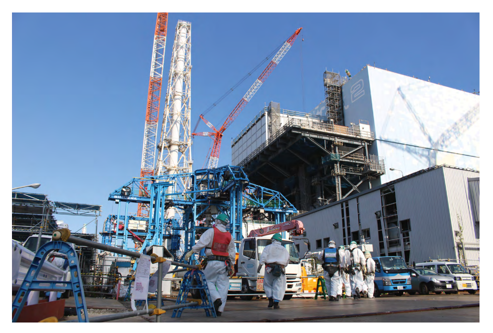
Workers heading to south of the Unit 2 reactor building of the Fukushima Daiichi Nuclear Power Plant to install the adjoining platform.

The Fukushima Daiichi accident has affected nuclear energy strategy in different countries and regions in different ways and to different extents. It also highlighted the strong importance of human behaviour and organisational background for nuclear safety. The political, economic and social issues, including future energy supplies, global climate change, costs of alternatives and security of energy supply, have varied across regions and countries. A few countries, such as Germany, have made the decision to phase out their nuclear generating capacity. Elsewhere, low electricity prices and the difficulty of financing new nuclear construction (especially after the global financial crisis of 2008) have led to fewer new nuclear plant construction projects and some decisions to reduce generating capacity or close older reactors in particular. Some countries have continued to expand their nuclear generating capacity with the construction of new reactors and a growing list of "newcomer" countries are laying the groundwork to build new plants to meet future energy security and environmental goals.