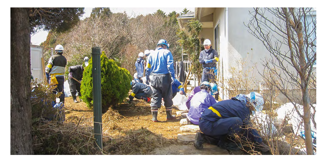
Workers decontaminating a residential garden in Okuma Town (photo taken in March 2016).

Although much remediation work has been effectively completed, further attention is needed regarding the means for regulation and final disposal of removed soils. Table 3.1 provides some details on the amounts of wastes removed from the Special Decontamination Areas (SDAs) and Intensive Contamination Survey Areas (ICSAs) in the course of clean-up, and the volumes of materials that have been moved from Temporary Storage Sites (TSS) to the Interim Storage Facility (ISF) or other means of waste management such as incineration or recycling, as well as the associated costs.