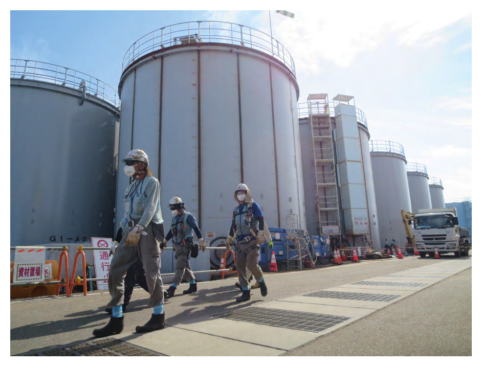
Workers performing maintenance on tanks for storing ALPS treated water installed on the premises of the Fukushima Daiichi Nuclear Power Plant.