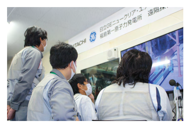
Operators in the remote control room on the premises of the Fukushima Daiichi Nuclear Power Plant. Remote control technologies suitable for various working conditions have been developed and are used where applicable.

Effective and efficient solid waste management is at the core of safe economic and timely decommissioning, and yet it remains one of the most challenging areas for nuclear programmes to demonstrate full lifecycle stewardship to the public. Many countries have struggled to establish disposal sites for spent nuclear fuel and highly radioactive waste and continue to face challenges in the scientific, engineering, societal and policy domains. This is true also for Japan where although studies on treatment and handling methods are underway at present, final plans for the disposal of radioactive waste from the decommissioning of Fukushima Daiichi cannot yet be established.