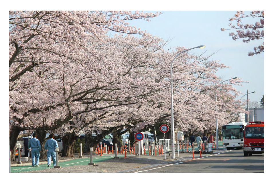
Cherry blossom trees at the Fukushima Daiichi Nuclear Power Plant. Many cherry trees on the premises were cut down after the accident for tank installation and ground surface pavement work (i.e. covering most of the site's ground by pavement to prevent rainwater from seeping underground), but some remain for the workers to enjoy. Decontamination is progressing on the premises, and employees working in the area of the photo do not have to wear protective gear.

To address near-term challenges in handling very low-level post-accident radioactive waste, the NEA examined how to develop a complex waste characterisation and categorisation process. NEA activities have also focussed on post-accident recovery management, including balancing decisions in radiological protection, as an important pillar of ensuring public health and well-being. Human aspects of nuclear safety, such as regulatory safety culture and broader stakeholder involvement in decision making, have been a significant focus of NEA activities. This report details the range of such initiatives and the lessons learnt. The activities of other international organisations are acknowledged and referenced as well.