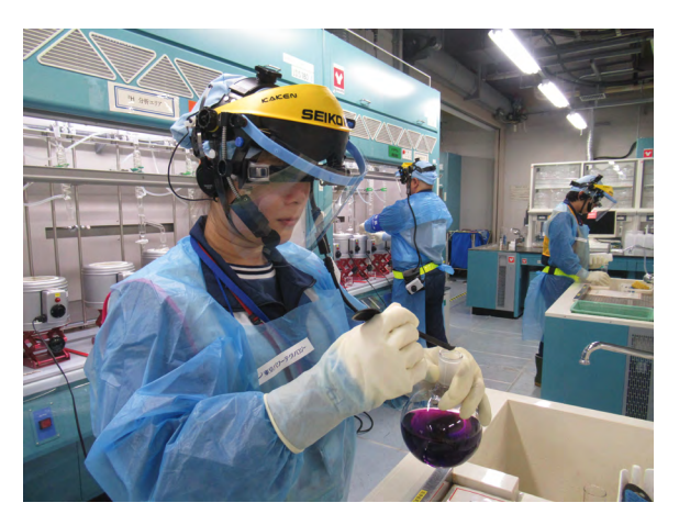
Worker analysing radioactivity concentration and water quality of samples collected at and around the Fukushima Daiichi Nuclear Power Plant. A work support device called "smart glasses" is worn to improve the productivity and quality of data entry and confirmation.

More broadly, there are many aspects of the accident that can serve to enhance current expertise and develop a new generation of specialists both in Japan and around the world. This will benefit the global community well into the future and provide a strong incentive