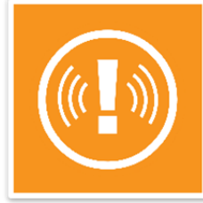
Nuclear security and safeguards