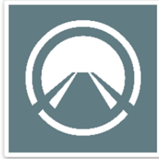
Transportation of nuclear substances