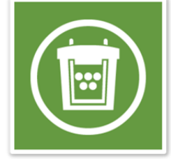
Waste management facilities