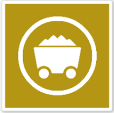
Uranium mines and mills