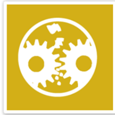
Uranium fuel fabrication and processing